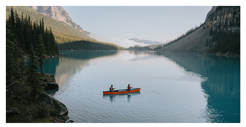
Mount Royal University, more info can be found here: https://www.schoolfinder.com/Discover/Article/1/6341/Calling-All-Adventurers!-Thi s-Degree-Program-Could-Be-For-You