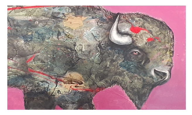
February - mikisowipîsim - bald eagle month paskwā mostos - buffalo

Our newest painting at the school represents our mascot, the buffalo, and the message of perseverance and strength. When a storm approaches, a buffalo will not turn its back or run away from it, rather, he will head straight into it, facing the storm no matter how hard it blows, the buffalo remains steadfast. The buffalo survives. Today, Indigenous peoples' refer to "EDUCATION" as the new buffalo.